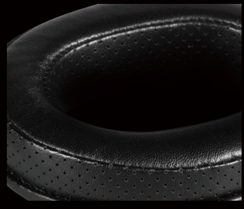
Genuine Sheep Skin Ear Cushion