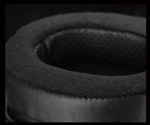
Synthetic Leather With Flannel Wrapping Ear Cushion

Many planar magnetic headphones require high-power amplifiers to drive them. The QUAD ERA-1 combines high sensitivity with low impedance to enable excellent performance with a wide range of partnering devices, from portable audio players to high-end headphone amps. QUAD's valve-based PA-One headphone amp/DAC makes a superb match for the ERA-1, combining sonic clarity and fluidity to stunning effect.